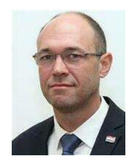
Mr Davor Ivo STIER Foreign Affairs Committee

Croatian Democratic Union - Group of the European People's Party (Christian Democrats)